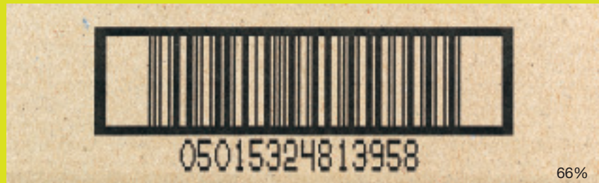
EAN128 (on Recycled Board)