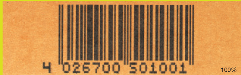
EAN13 (on Kraft Board)