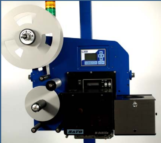
EcoPrint125 RH with BlowBox Option