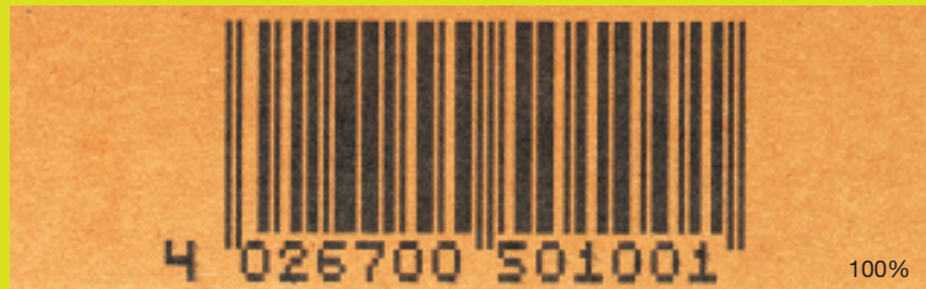
EAN13 (on Kraft Board)