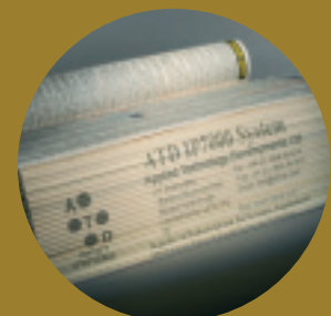
Paper and web materials