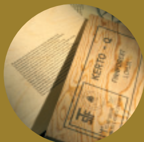
Timber construction materials