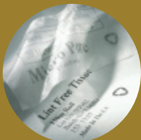
Tissues and fabrics