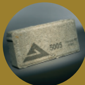
Concrete construction materials